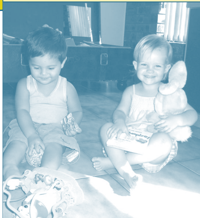
Above: Part of the NT population growth at play

The projects will provide employment and training opportunities for Indigenous people in the regions, and will also bring economic and social benefits.