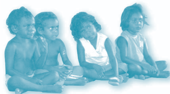
Tiwi children at the Child Care Centre