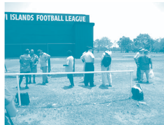
Viewing the Nguiu oval