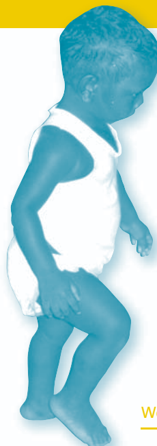
Welcome dancing on arrival at the Child Care Centre