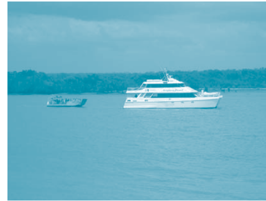
The fabulous new Tiwi Island ferry Arafura Pearl