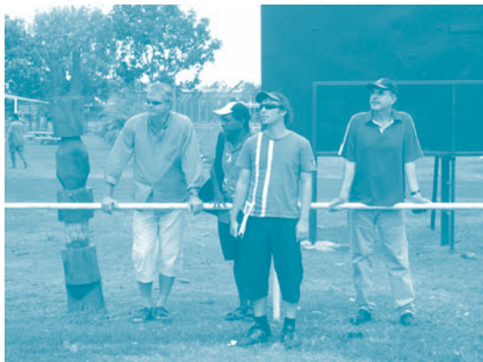
Committee members visit the Nguiu oval